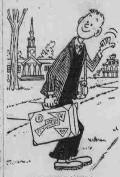
TRAVELING DURING VACATION? Head for these