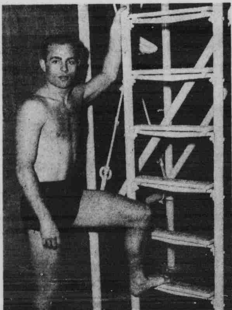
Cotter... diving champ

The exclusive Viceroy filter is made from pure cellulose—soft, snow-white, natural!