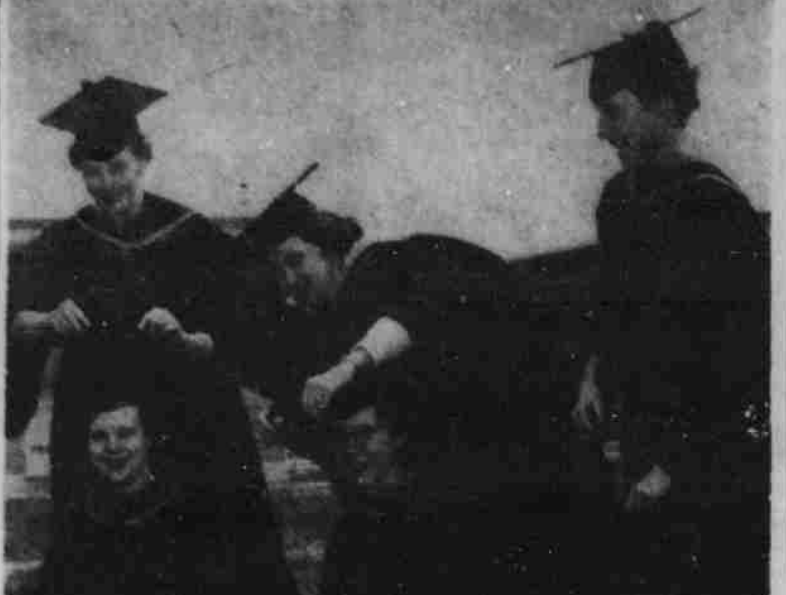
MB's Show Style