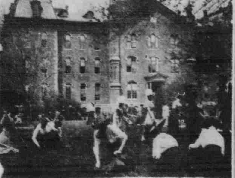
Then . . .

In case of rain, the Ivy Day activities will be held in the University Coliseum.