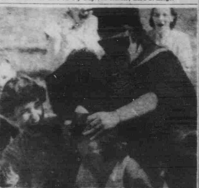
Now . . .

Until 1942 Ivy Day had always been held on Friday with classes dismissed. Indeed, until 1900 regular classes were held on Ivy Day.