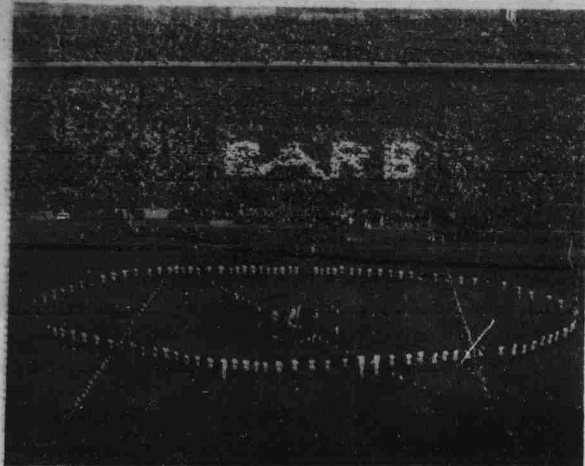
NU band gives halftime performance during Homecoming ceremonies. The card section honors the group.