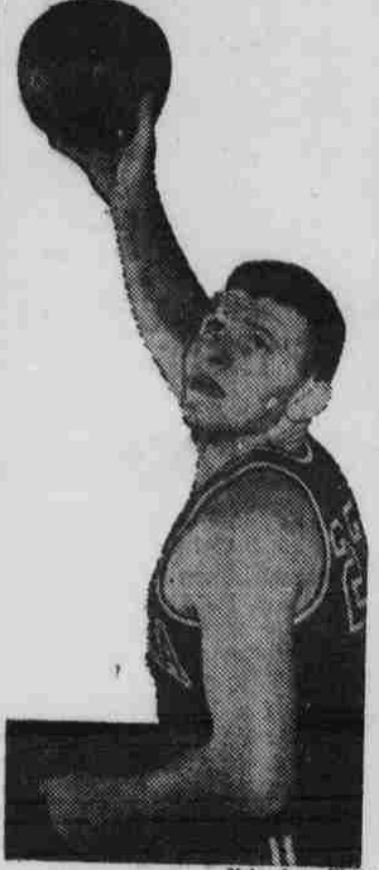
Nebraskan Photo LeRoy Bacher