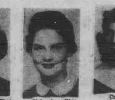
Nebraska Photo Edwards