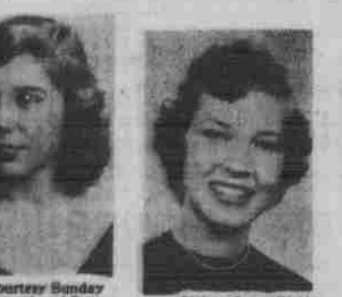
Nebraska