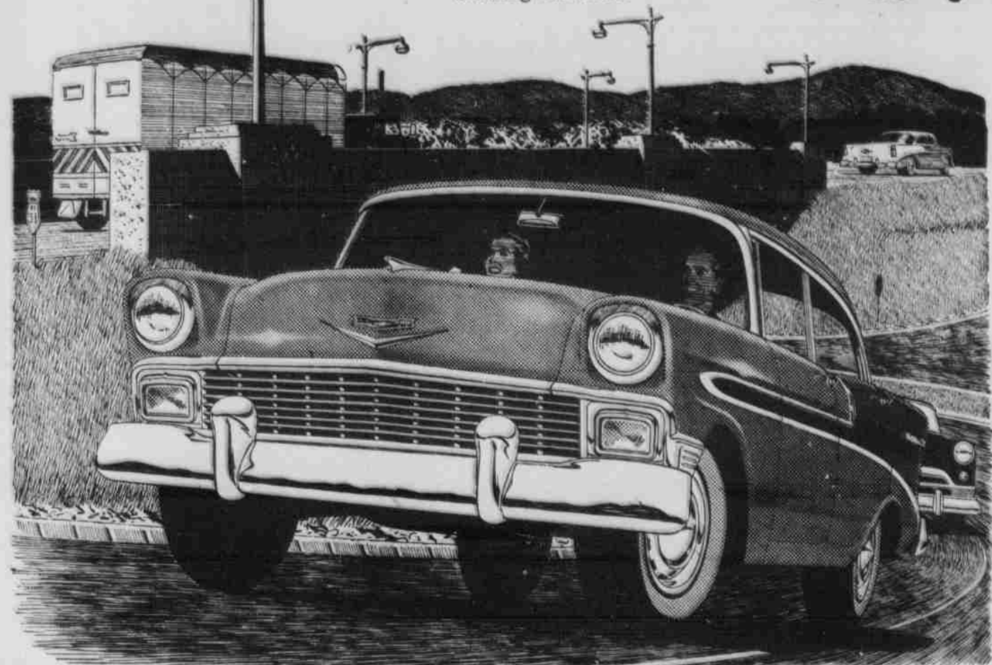
The Bel Air Sport Sedan—one of 19 new Chevrolet beauties. All have directional signals as standard equipment.