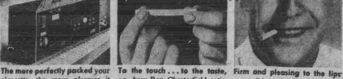
cigarette, the more pleasure it an Accu-Ray Chesterfield satis- . . . mild yet deeply satisfying to gives . . . and Accu-Ray packs fies the most . . . burns more the taste - Chesterfield alone is Chesterfield far more perfectly. evenly, smokes much smoother. pleasure-packed by Accu-Ray.