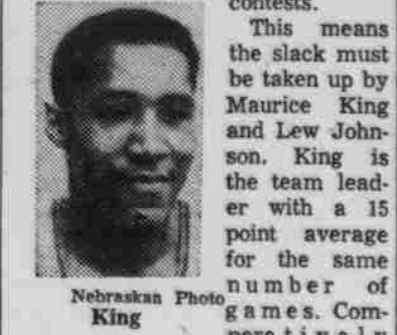
Nebraska Photo King