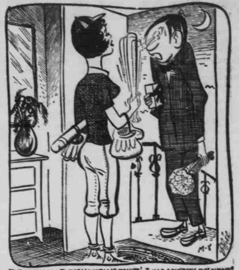
"BUT WHEN I SAID PLAY BALL WITH ME TONITE—I HAD SOMETHING ELSE IN MIND."