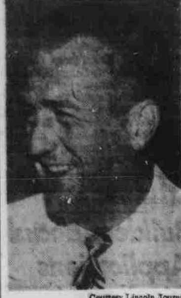
Bush