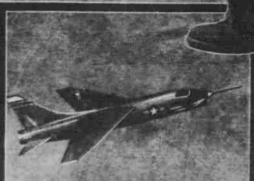
Newest Supersonic Fighter. The Chance Vought F8U, latest in a growing group of military aircraft to fly faster than sound. Like most other record-breakers, it is powered by a P & W A J-57 turbojet.