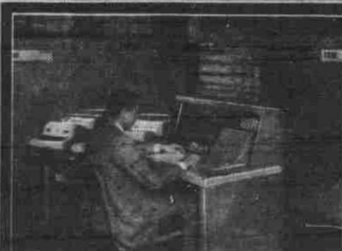
First 702 Computer in East. Just installed, this advanced I.B.M. computer joins earlier electronic marvels that played a vital role in the development of Pratt & Whitney Aircraft's famed J-57 jet engine.

Working engineers of P & W, waiting for classes to begin at R.P.I.'s new graduate center. Courses include Aeronautical Engineering, Physics, Mathematics, Nuclear Technology, Management Training.