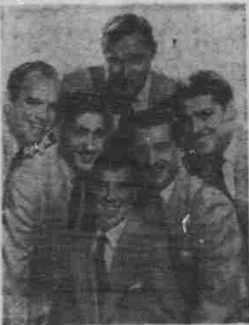
Bill Haley And His Comets

• Best Sellers Include: Ladies' Man Rumba Boogie Moving On