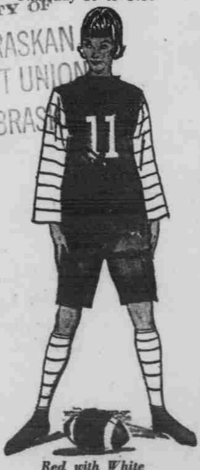
Red with White

Here are the "winnahs" on the fun-time—slumber-time squad! Warm balbriggan lounge and sleep wear that appears outdoors for sports or idling in the dormitory after the date . . . before lights-out. "Touchdown Set" was made especially for the comfort—and fun—of the "College set" . . . at a price practical for a college-days budget. Lucky 7—or lucky 11 . . . you'll be in luck comfort and pocket wise both, with Touchdown Set . . . designed especially for "All-American" Beauties by Tommy's!