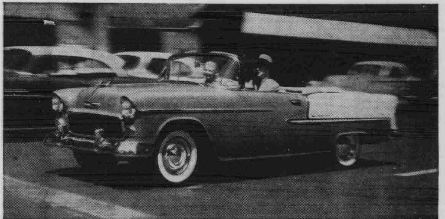
Great Features back up Chevrolet Performance: Anti-Dive Braking—Ball-Race Steering—Out-rigger Rear Springs—Body by Fisher—12-Volt Electrical System—Nine Engine-Drive Choices.

When you need a quick sprint for safer passing, this V8 delivers!