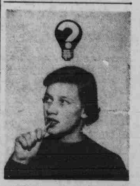
PUZZLED coed ponders Rush Week problems but finds that all works out well.

Student officers are in charge of governing each house. House mothers live at residences and act as mothers away from home.