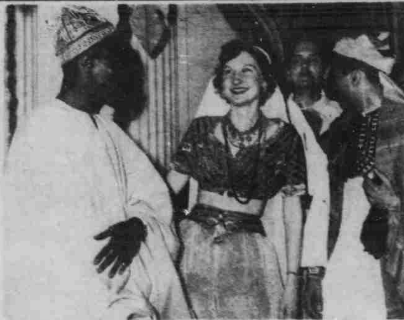
MANY NATIONALITIES are represented at the University. Here some foreign students join in a party featuring native costumes.

The direction of Homecoming activities is in the hands of the Tassels and Corncobs. They plan the parade, presentation of the queen and so on.