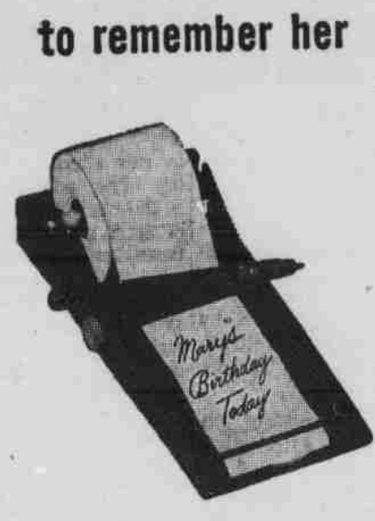
to remember her