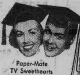
Paper-Mate TV Sweethearts

Now! Write legible papers and notes, because Paper-Mate never smears, blots or clogs! Guaranteed leak-proof. No stoppages—more than 70,000 words without refilling.