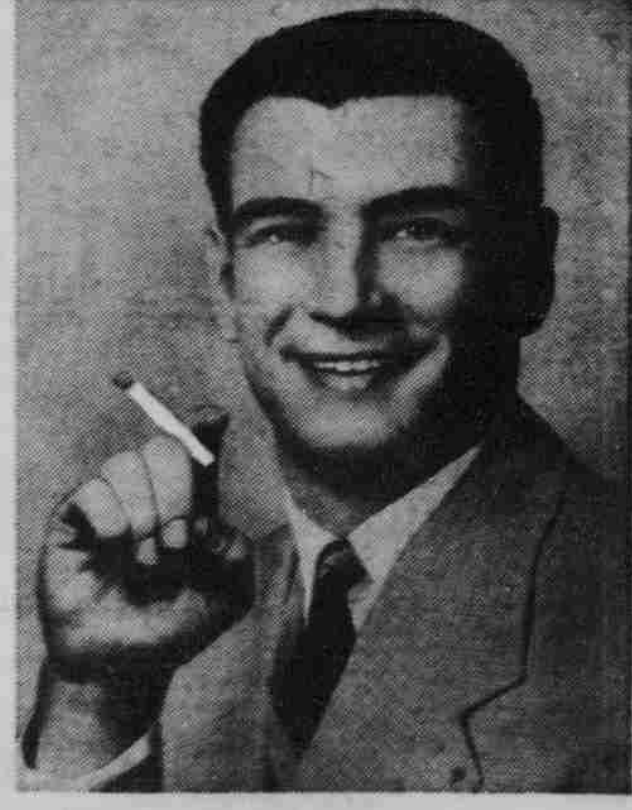
"Chesterfields for Me!"

The cigarette with a proven good record with smokers. Here is the record. Bi-monthly examinations of a group of smokers show no adverse effects to nose, throat and sinuses from smoking Chesterfield.