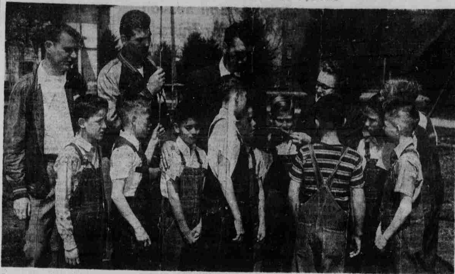
ALL-SPORTS DAY GUESTS . . . Youthful residents of the Nebraska Home for Children receive free tickets to witness the University's All-Sports Day activities Saturday. Contributions by alumni and fans made the gifts possible. In the above picture