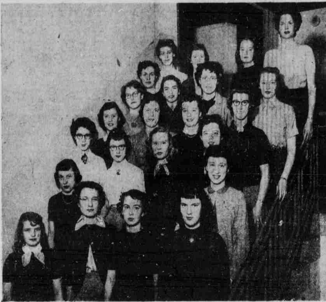
OUTSTANDING FRESHMEN . . . Alpha Lambda Delta, honorary scholastic fraternity for freshmen women, will initiate 23 pledges Sunday, April 20.