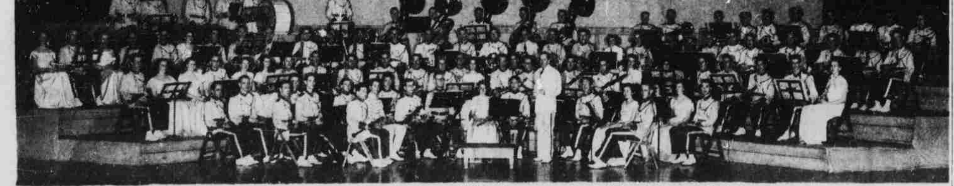
CONCERT TIME.. University concert band now on a three-day tour of Nebraska communities.