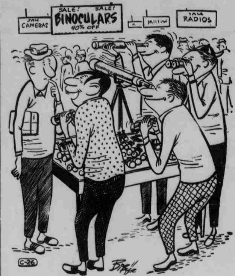
"You know that new fraternity house they built next door?—It's a SORORITY!"