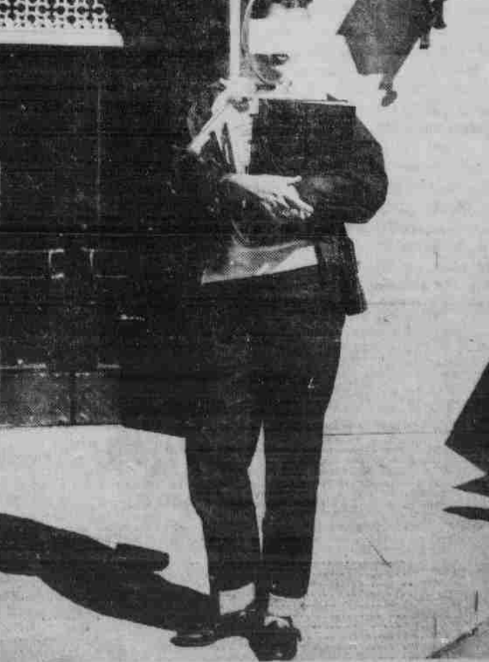
in such sack cloth doesn't snap her out of her trance, nothing campus scene—and also shown is just exactly what is frowned upon for University women. It is suggested that Nebraska coeds act and appear a s adult college women.

While the coed in the picture may feel comfortable, she certain-If Kampus Kues can't get the