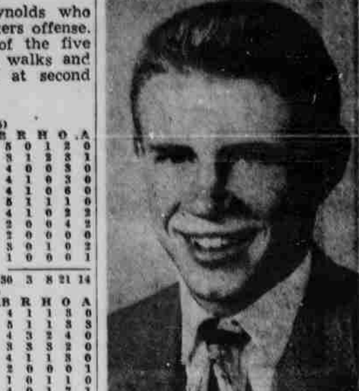
braska's individual honors in the diamond loss to Kansas.