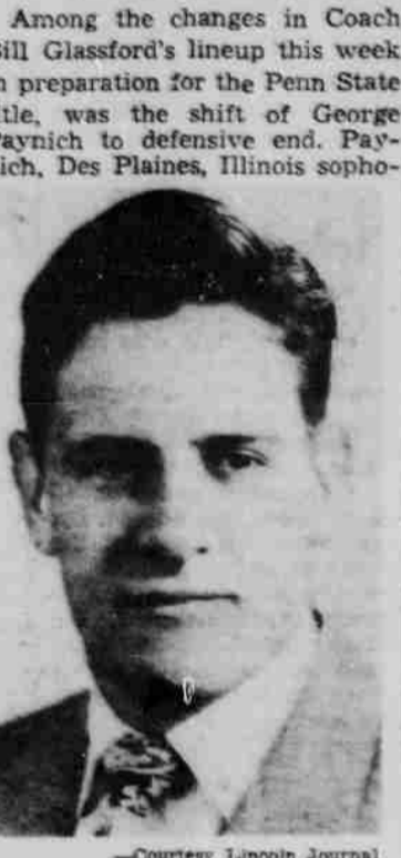
more, stands six-one, weighs 180 pounds and is 21 years old. He was previously used as an offensive end...