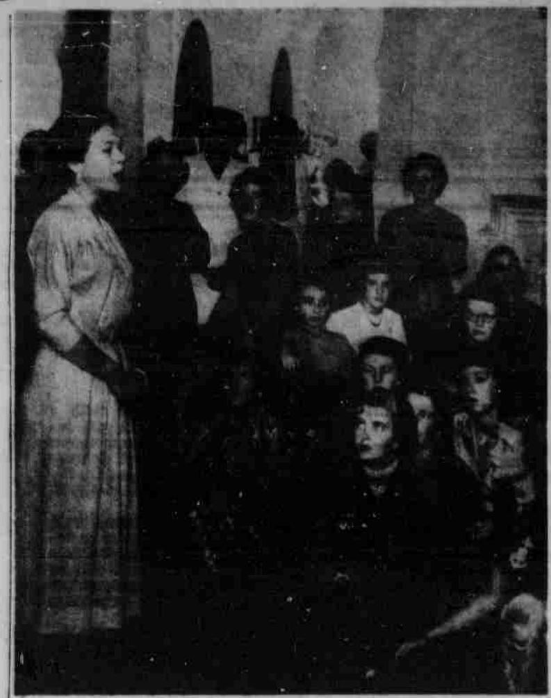
WELCOME RUSHEES —Active entertained rushees at six parties "dates" each day was set aside for rushing tactics by each of the 24 fraternities.