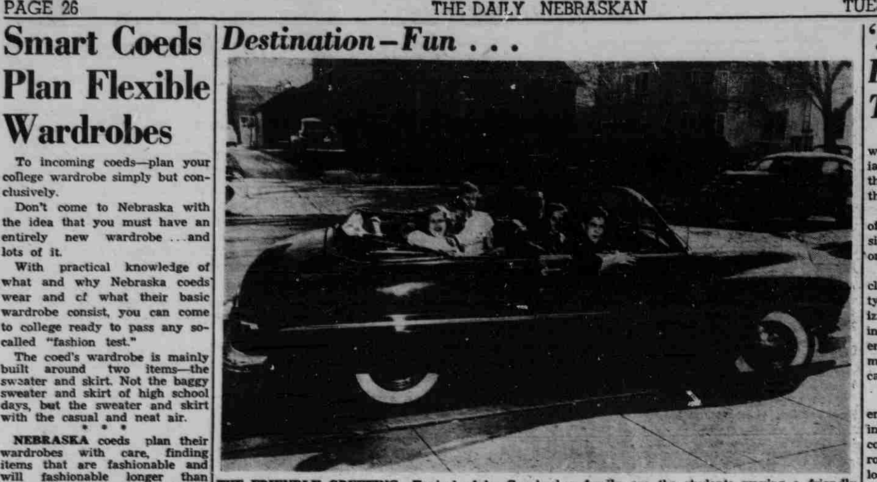
THE FRIENDLY GREETING-Typical of he Cornhusker family are the students waving a friendly greeting to you, the new student. The whole Cornhusker family is waiting to meet you, help you with your problems, and further your abilities.