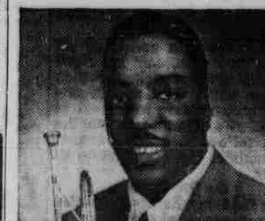
"ERSKINE HAWKINS (above) plays W. C. Handy". . . St. Louis Blues, Careless Love, Memphis Blues, 3 others . . . "DESIGNED FOR DANCING"! It's just one of 15 NEW dance albums by RCA VICTOR. 15 great bands, 15 great composers, 90 all-time hits played the danceable way! Like Glenn Miller days! Erskine Hawkins' album has the beat you're foot adore! Get it at W. T. GRANT CO., 1005 O STREET