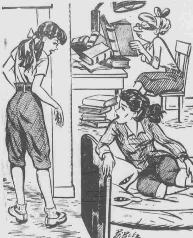
"Don't worry about her—she'll have plenty of dates when finals start showing up."