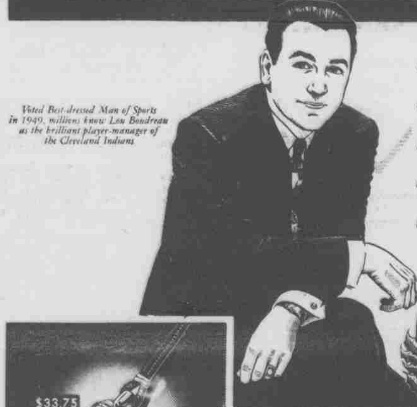
Voted Best dressed Man of Sports in 1949, millions know Lou Boudreau as the brilliant player-manager of the Cleveland Indians.

says LOU BOUDREAU , impressed by the distinction of ELGIN styling and the promise of superb performance from the DuraPower Mainspring