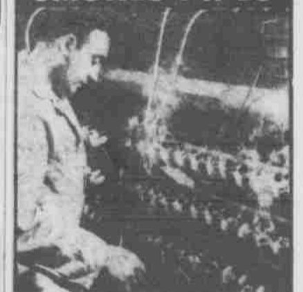
Actual photograph of Unknown's exclusive Pipe-Smoking Machine, Pre-Smoking Dr. Grabow Pipes at the factory with fine tobacco.