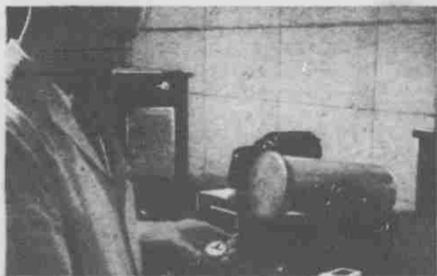
So round, so firm, so fully packed. Typical of many devices designed to maintain standards of quality, this mechanism helps avoid loose ends . . . makes doubly sure your Lucky is so round, so firm, so fully packed.