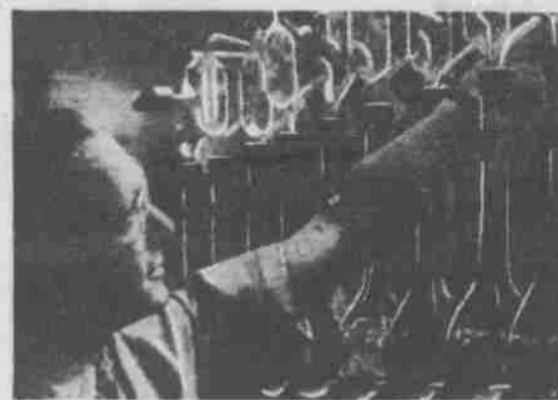
Testing tobacco. Samples from every tobacco-growing area are analyzed before and after purchase. These extensive scientific analyses, along with the expert judgment of Lucky Strike buyers, assure you that the tobacco in Luckies is fine!

Armed with this confidential, scientific information—and their own sound judgment—these men go after finer tobacco. This fine tobacco—together with scientifically controlled manufacturing methods—is your assurance that there is no finer cigarette than Lucky Strike!