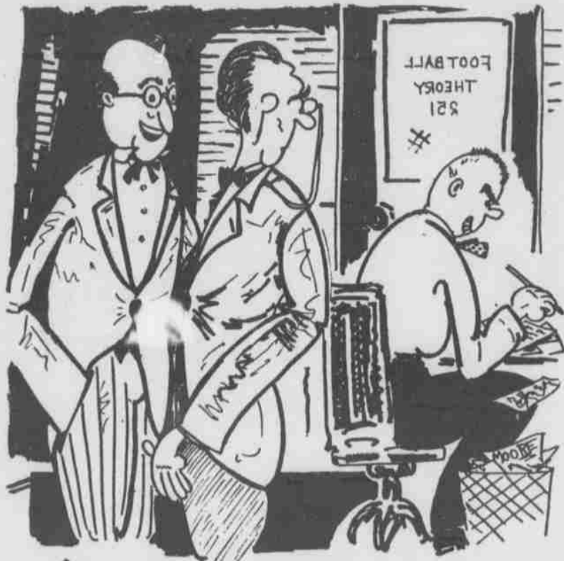
"HE WAS TOO DUMB TO PASS THE COURSE, SO I MADE HIM A READER!"