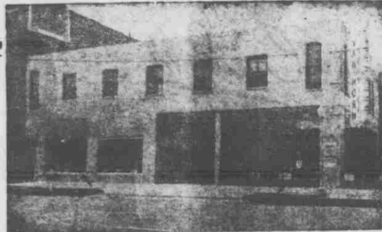
Our 12th and Q Service Station and Parking Lot.