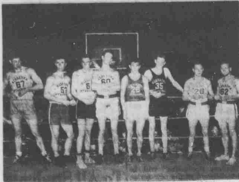
INTRAMURAL BOXING champs are shown above.