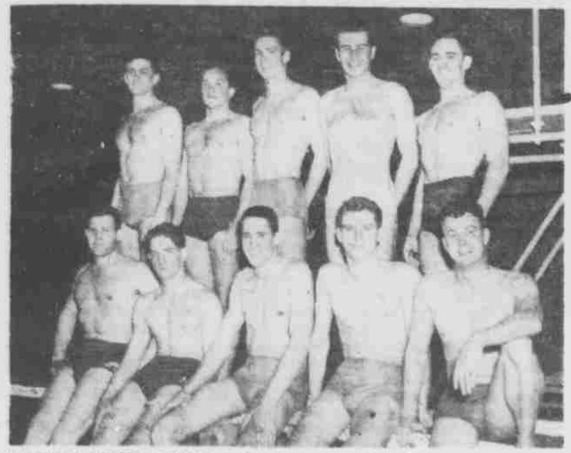
THE 1949 INDIVIDUAL swimming champions line up for a parting shot. Iowa State claimed 7 top places to 4 for Oklahoma and 1 for Nebraska.