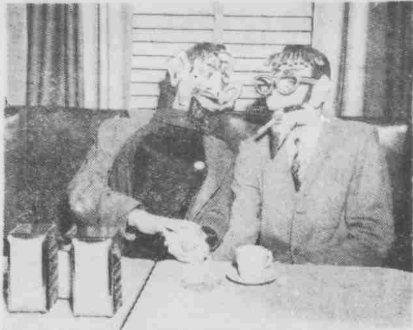
LATEST VICTIMS of a whirl-wind pinning are Fanny Screams (left) Betta Tekka Nappa, and Ivel Seques. These two set a record! That's a Chesterfield he's smoking!

Wisdom: "Knowing what to do next." Skill: "Knowing how to do it." Virtue: "Not doing it." "Why does he hang around that woman with a post?" "Oh, he's just waiting for history to repeat itself." A wise man is like a pin; his head keeps him from going too far. Then there was the girl fiddler who kissed her violin good-night and took her bow to bed with her. "What color was her bathing suit?" "Darned if I know, she had her back turned." He: "The first time I hear you contradict me I'm going to kiss you." She: "You are not!"