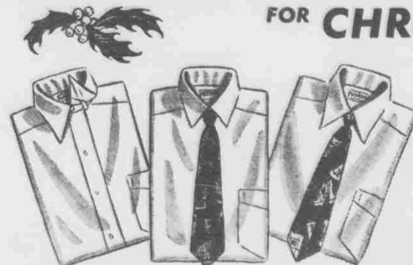
"BARONET" $7.50 "DALE" $4.50 "HULL" $3.65