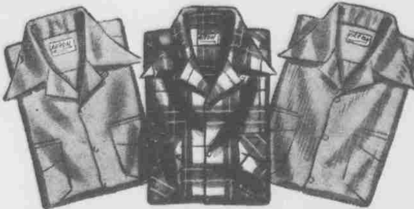
ARROW SPORTS SHIRTS FROM $4.00