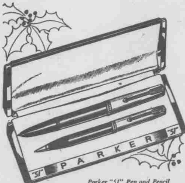
Parker "51" Pen and Pencil Set. Gold-filled cap. $23.75.

Copyright 1948 by The Parker Pen Company