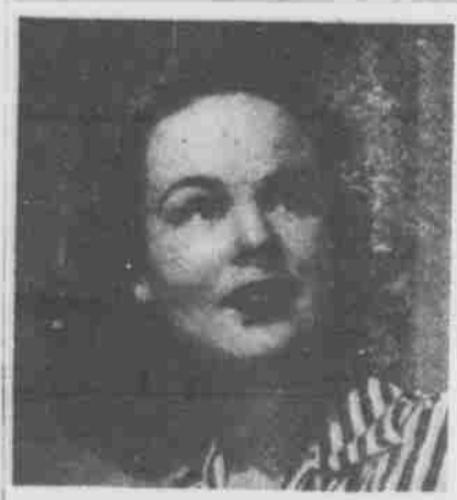
"Try Seventeen. You'll love it," says Senior

All applications for membership into the Varsity Dairy club must be submitted not later than Wednesday, Nov. 10.