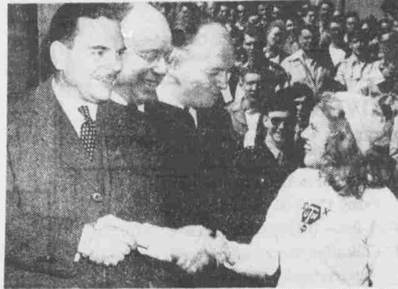
Thomas E. Dewey, Robert Taft, and Harold Stassen visited the campus and spoke to University students at special assemblies. A member of Tassels, women's pep organization, is shown shaking hands with all three men whose pictures were then superimposed