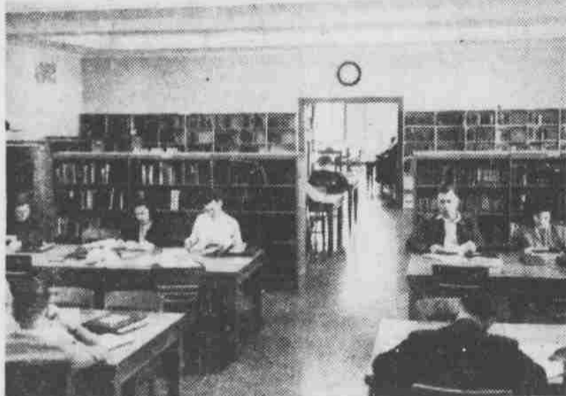
Fluorescent-lighted study rooms make studying a pleasure for students in the spacious rooms of modern Love Memorial Library located in the center of the Lincoln campus.

One of the most practical shoes for back-to-school wear! Men of all ages like its within-the-budget price, its easy-going comfort, its trim lines, and its any-occasion versatility. Indian tan side leather with rubber soles, leather heels. Goodyear welt. 6-11.