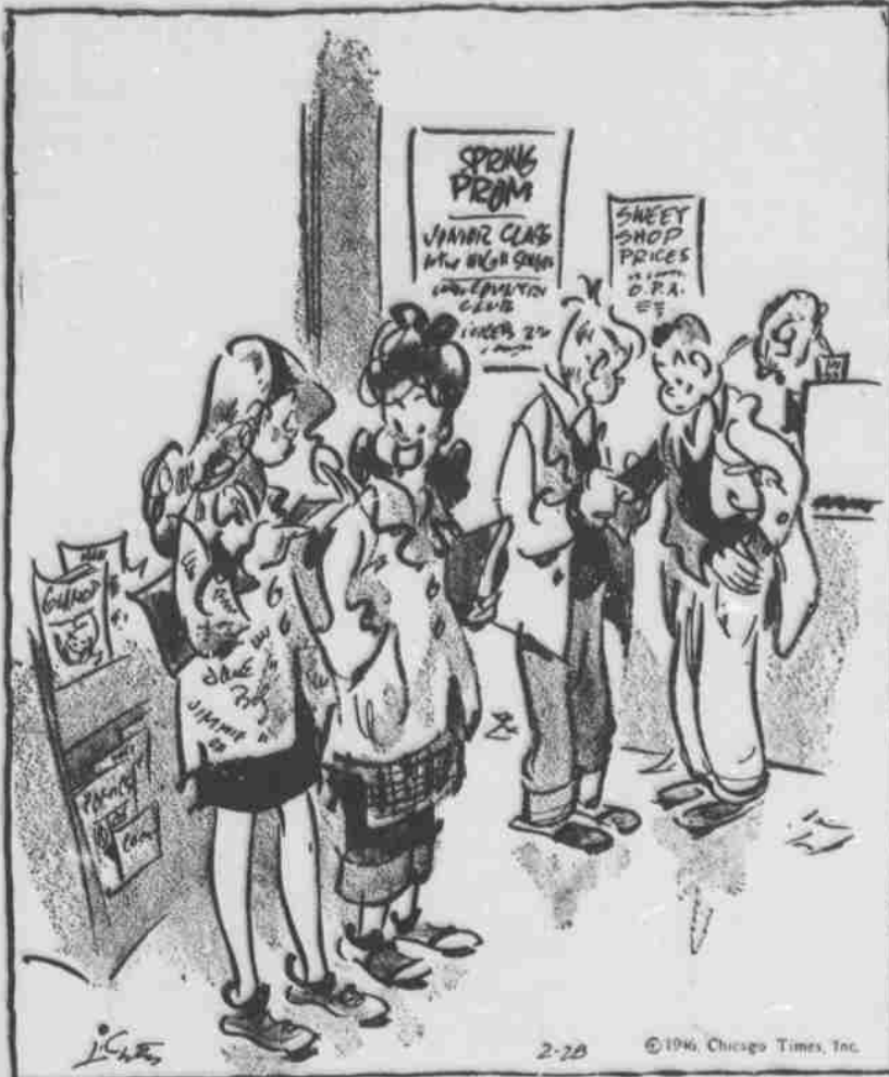
"I think girls develop much faster than boys! Notice how our appetites always far outstrip their allowances!"