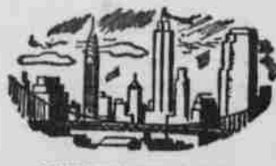
TOWERING CITY SPIRES