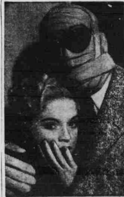
Romance blooms on Campus.