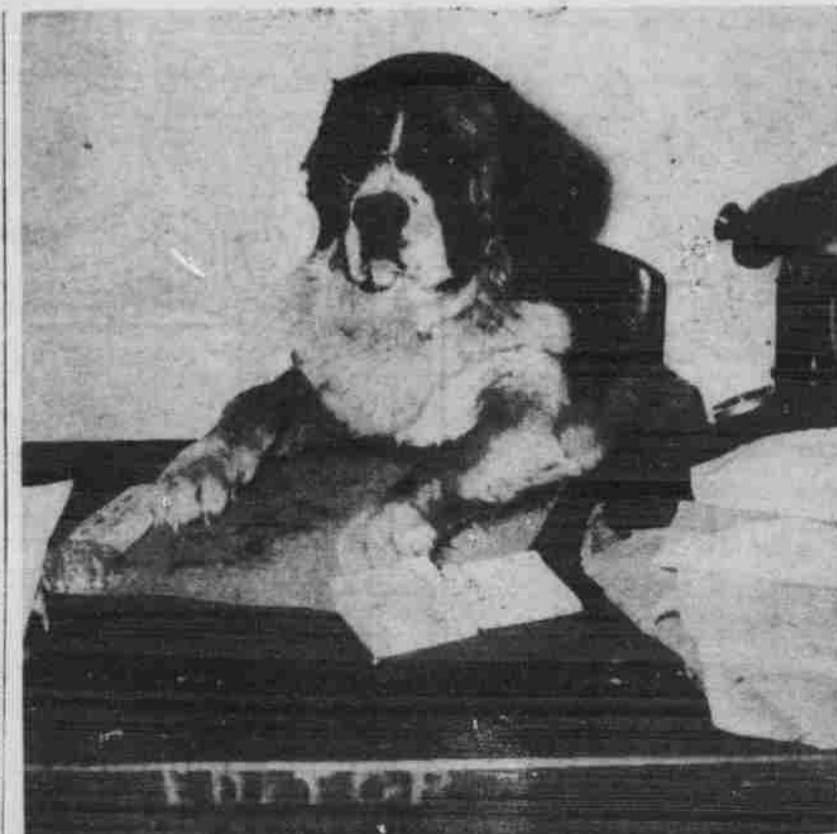
BOWSER, new editor of The Daily Nebraskan.