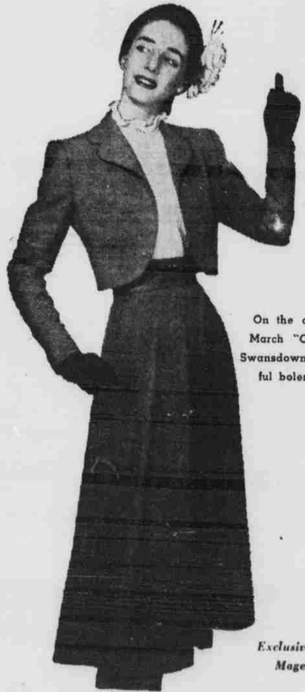
On the cover of March "CHARM," Swansdown's beautiful bolero suit.