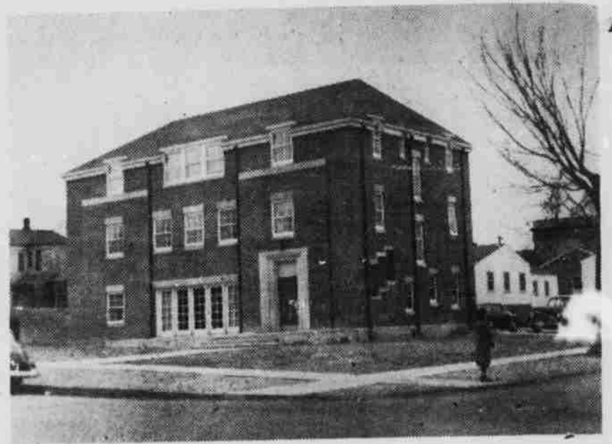
SIGMA ALPHA MU FRATERNITY will hold open house Sunday, Feb. 15, from 2 to 5 p.m. at which time all students and faculty members of the University are invited to inspect the new chapter house, located at 733 No. 16.

The house has been under construction for the past twelve months, the members occupying the modern red brick structure shortly after the first of the year.