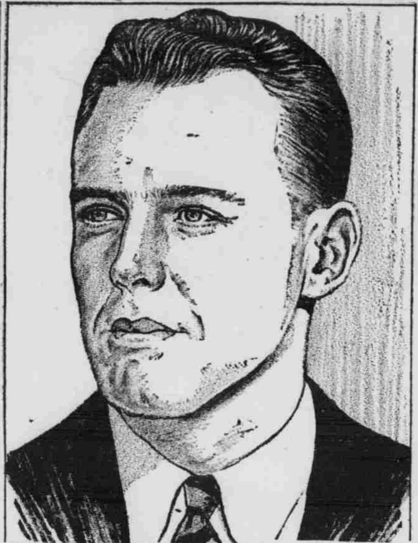
SOONER MENTOR —Nebraska's Cornhuskers will battle Coach Bud Wilkinson's Oklahoma Sooners in the Scarlets' next outing at Memorial Stadium. The youthful Wilkinson, at the helm of the co-champion Oklahomans, will bring a favored and title brand Sooner crew to Nebraska Nov. 22 for the Huskers final Big Six engagement for the 1947 season.